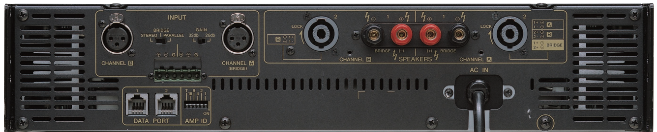
T5n Rear Panel