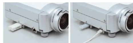
Wireless Networking with USB Wireless LAN Adapter (Left Image)