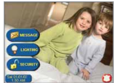
Custom End-User Screen