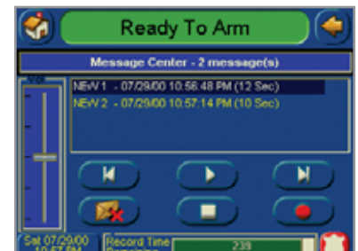
Message Center Screen