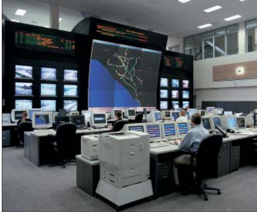
Caltrans, Irvine, CA.—Transportation Management Center. Installed by MCSi. A 3 x 3 MultiScreen System of IRUS screens in Zero Edge frames. Includes custom monitor arrays. System 200 Framing System U.S. Patent No. 5,103,339. Zero Edge Framing System U.S. Patent No. 6,000,668.