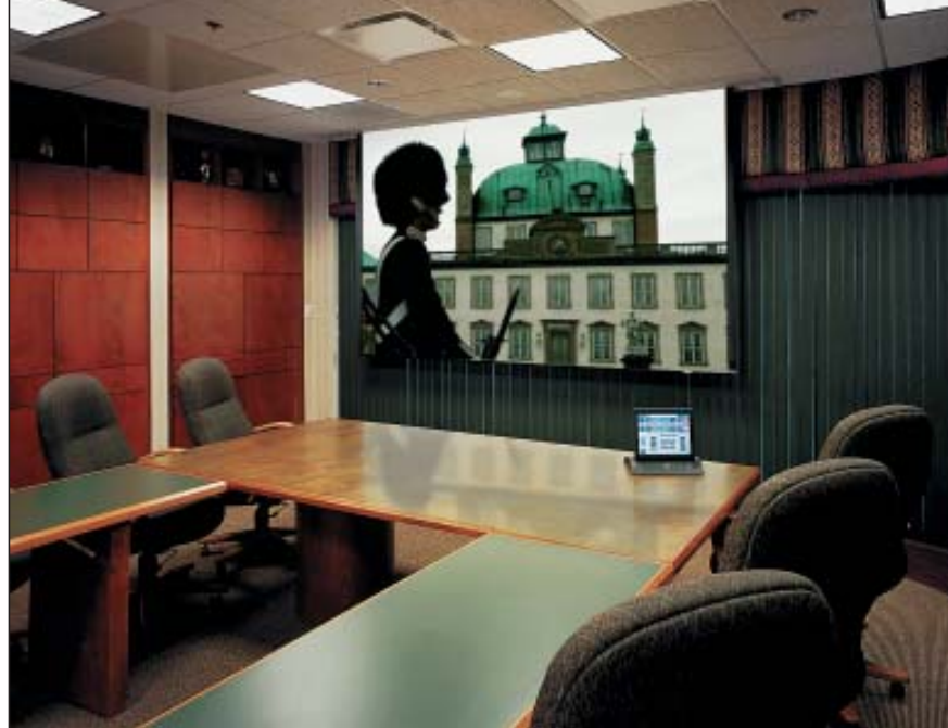
C.A.P.E. Facility—IMMI, Westfield, IN. Dealer/Installer: Data Projections, Inc. U.S. Patent Nos. 5,341,241, 6,137,629 and 6,421,175. Other Patents Pending.