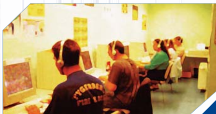
Classroom Training Rooms

The control switch box is a highly dependable tool trusted by business and educational professionals to conduct presentations. The control switch box links your personal computers to the projector with an additional output point, enabling you to split effectively your input source to both the projector and the sound system.