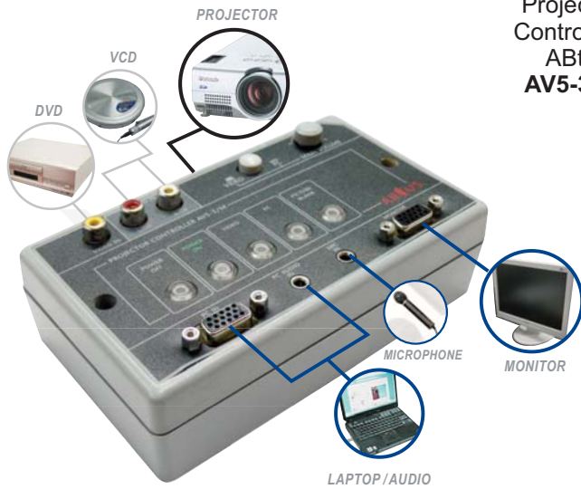
Projector Controller ABtUS AV5-3/M

The ABtUS AV5 series is a high performance Projector Controller designed for any small Multi Media Class Room or boardroom application.